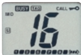
The photo shows actual display size.

* 35x24 mm, 1 1/8 x 1 5/16 in. dimensions